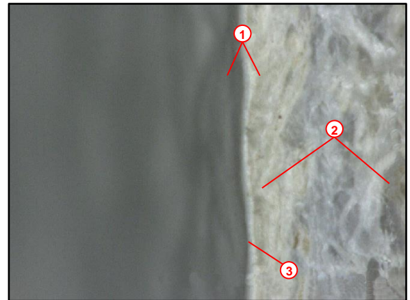
Figure 2. Top Layer Close-up