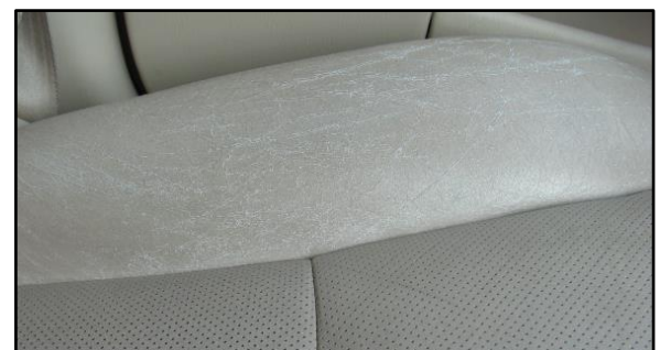
Figure 3. Wear Caused by Outside Influence